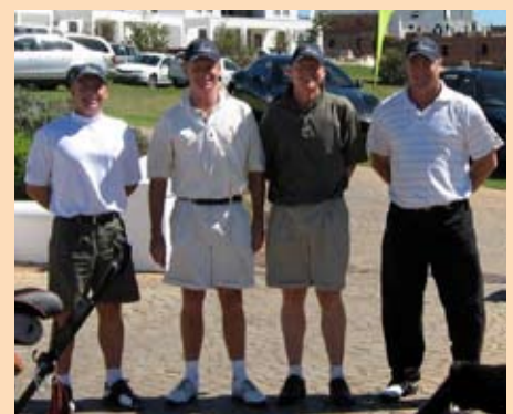
The winning fourball